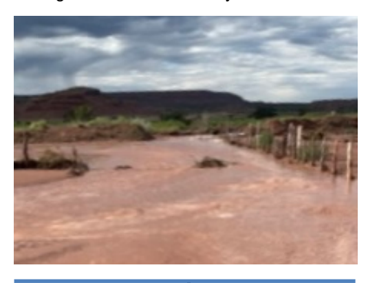
ZYEP continues from page 1

As monsoon season continues with heavy rainfall, our teams from the Office of Emergency Management, Department of Natural Resources, Utilities, Department of Safety, Emergency Medical Services, Tribal Roads, and the Community Pantry and their wood crew, have been working tirelessly to mitigate and direct flood waters to minimize damage within our community.