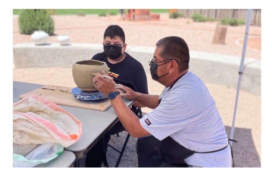
Members of the first apprenticeship cohort participated in the 5th annual Bernalillo Indian

"We learned about the traditional and cultural aspects of Zuni pottery, including the significance of the many designs and forms," she explained. "Pottery is more than just an art form. It's all of our riches, our tools, our identity, and even our protector. The clay itself is sacred; it's the flesh of our Mother Earth."