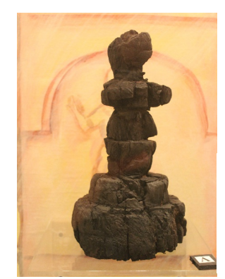
Burned candle holder from the mission at Hawikuh.

The planning took a long time due to the need for secrecy, dedication, and loyalty to the cause. Due to the repression and persecution of cultural and religious beliefs, it was difficult for like-minded leaders from different Pueblos to come together. This was made even more dangerous because some would betray fledgling uprisings to the Spaniards. Despite these dangers, planning persevered, with Pueblo and mestizo alike coming together to create the plan for rebellion. The plan resulted in runners being sent to the different pueblos with knotted cords - one knot for everyday until the Revolt. The day the final knot was untied, August 12<sup>th</sup>, was the day for all the Pueblos to rise up and attack the missions and settlements, killing as many as possible and driving off livestock. Next was to close off the roads to Santa Fe, with the final part of the plan to form a pan-Pueblo army to surround the capital and demand the Spaniards to leave or die at the hands of the army.